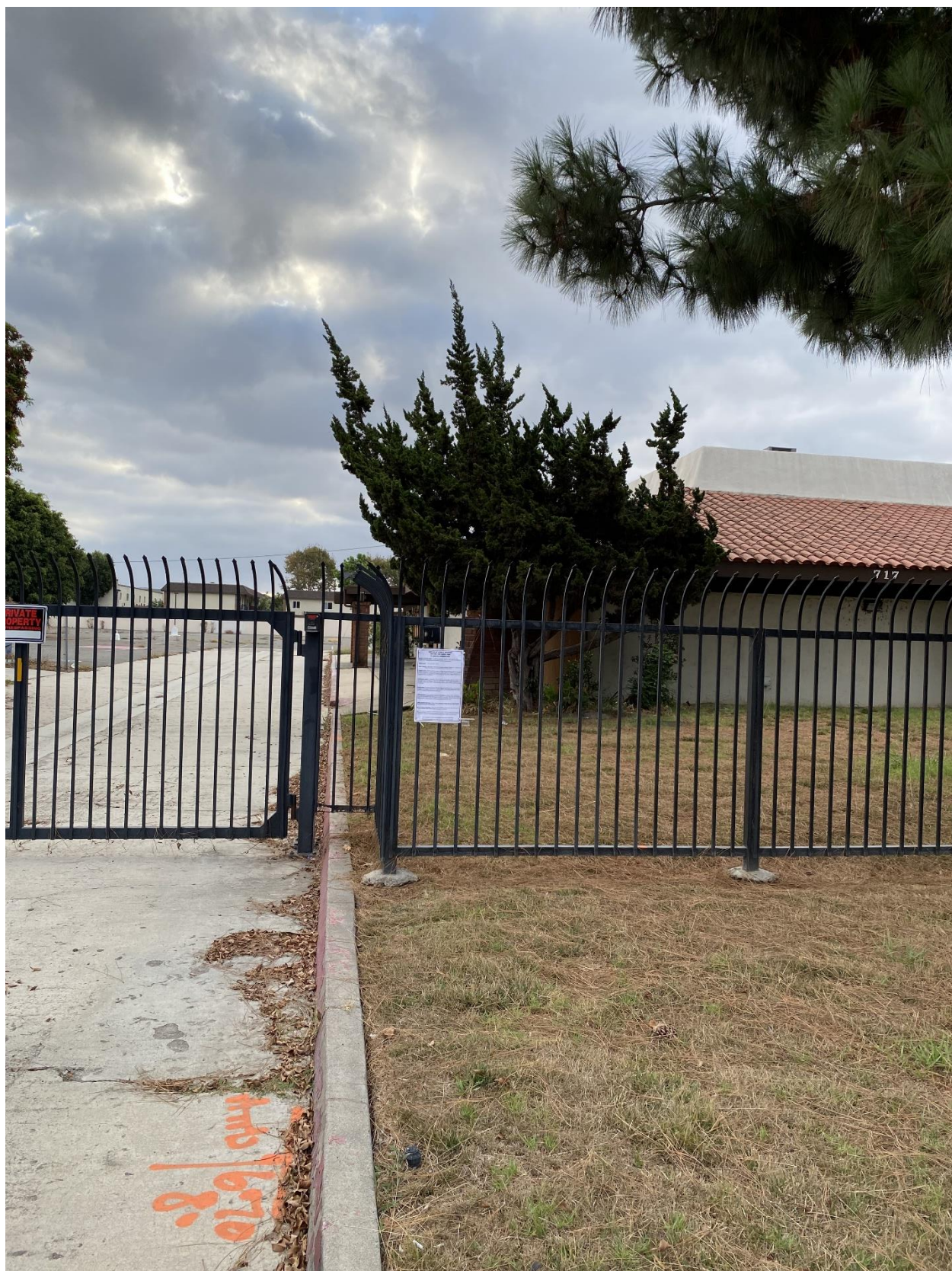
On-Site Posting – 717 S. Lyon Street – September 15, 2022